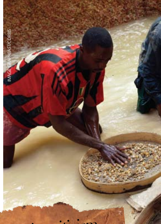
Below: Teachers and parents standing outside SOSL sponsored school classroom Right: Men mine for diamonds in Bo District, Sierra Leone

Despite criticism that it is a voluntary resolution and not legally binding throughout the entire international community, the Kimberley Process currently has 74 countries adhering to its regulations